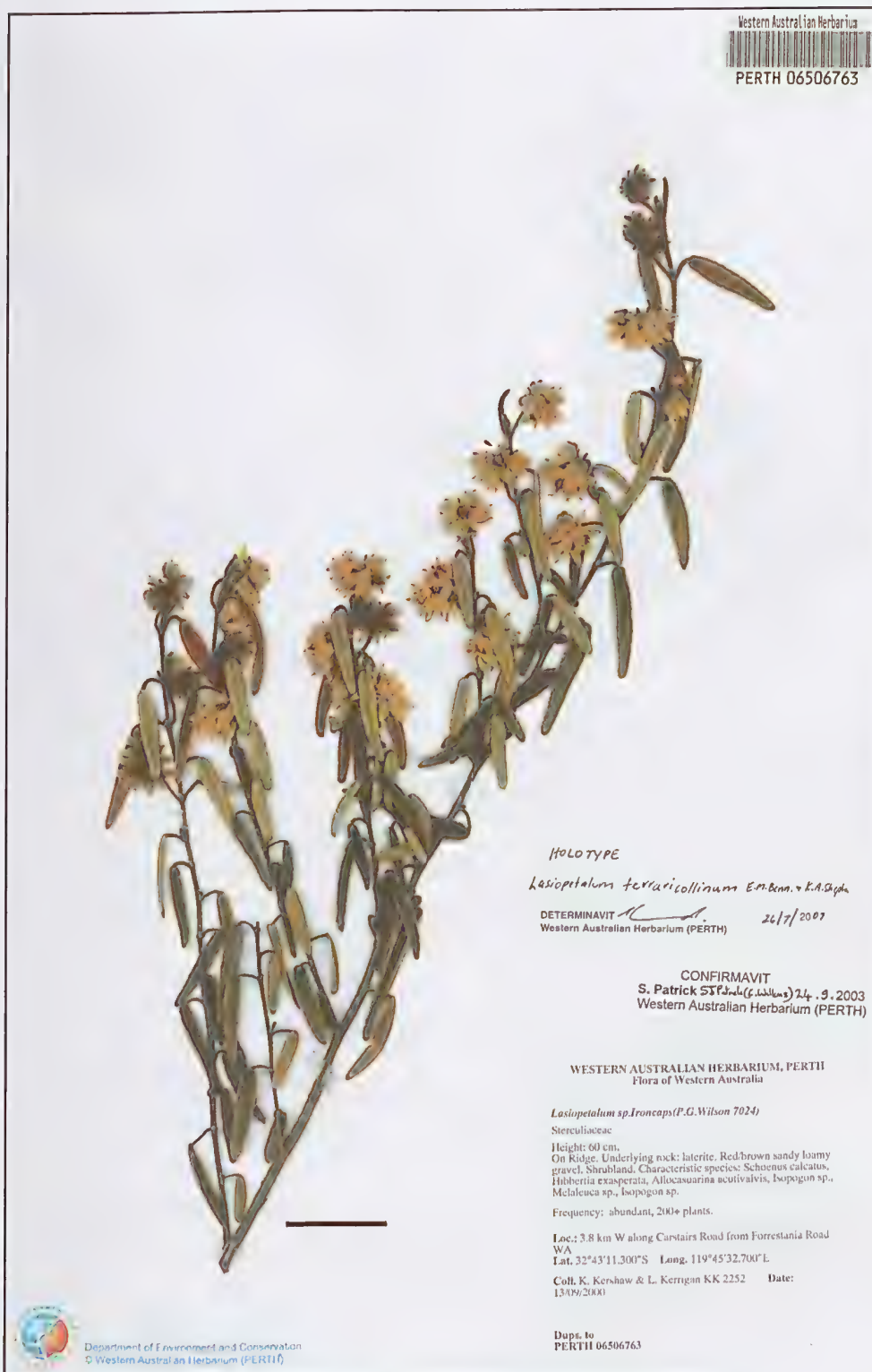
Figure 1. Holotype of Lasiopetalum ferraricollinum (K. Kershaw & K. Kerrigan 2252), scale = 3cm.